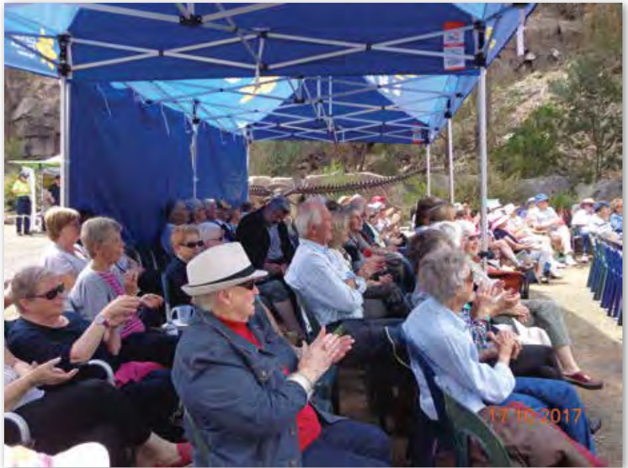
The audience enjoying Melodies and Memories