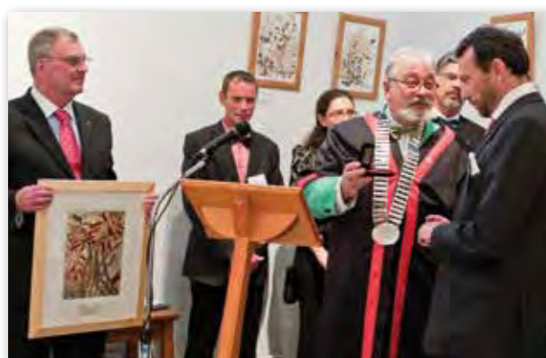
Mayor Cadart hosting a civic reception for the Mayor of Noumea attended by the late Governor of Tasmania, Peter Underwood