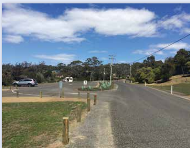
Reconstruction Works – Rheban Road, Spring Beach

Due to the total annual volume of greenwaste received at our four WTS's, burning is carried out in preference to mulching, because of overall cost savings to the ratepayer.