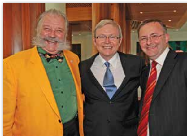
Mayor in Canberra with former Prime Minister Kevin Rudd and Anthony Albanese MP